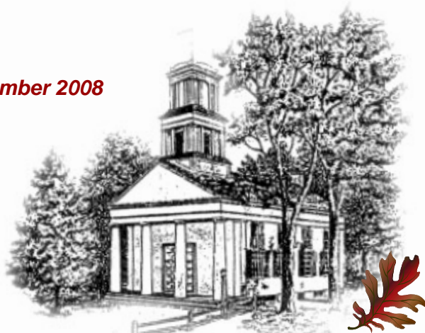
Colebrook Congregational Church